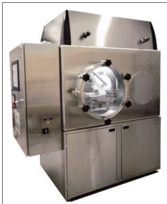
VanRX's Raptor system performs isolated filling.

Robotics traditionally have not been used in isolator systems because of concerns about hermetic sealing, particle generation, and vapor-phase decontamination systems. The Raptor system incorporates hermetically sealed, peroxide-compatible, stainless